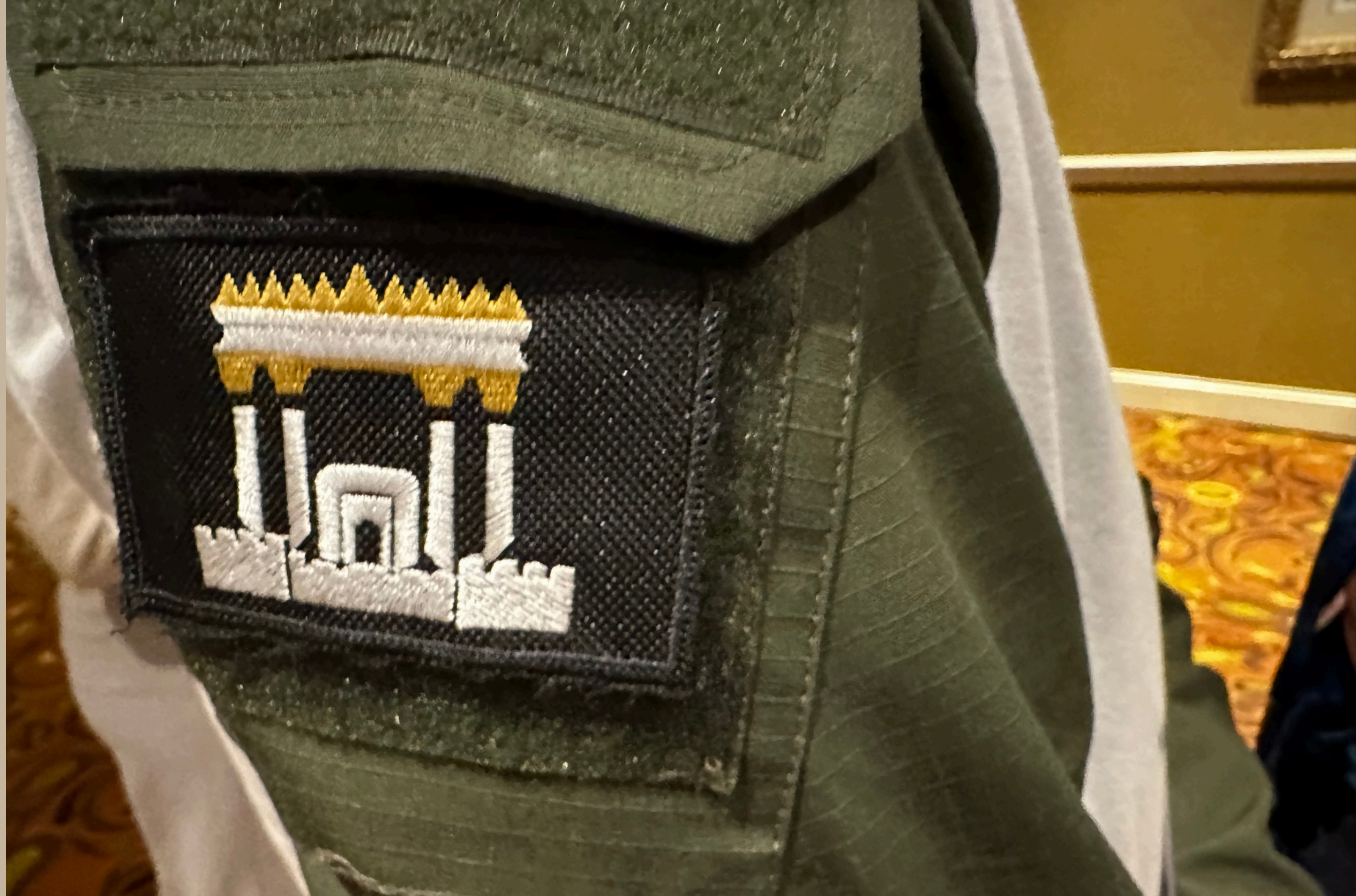
Patch of an IDF Soldier after 10/7/23